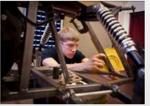
Hands-On Minds-On Learning Culture.