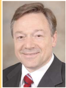
✓ U.S. Rep. Steve Kagen (920) 380-0061

Please call U.S. Rep. Steve Kagen and U.S. Sen. Herb Kohl and explain how EFCA would impact your business and your ability to create and retain jobs in your community.