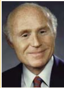
✓ U.S. Sen. Herb Kohl (920) 738-1640

Call Rep. Steve Kagen at (920) 380-0061 and Sen. Herb Kohl at (920) 738-1640 and urge them to vote “NO” on the Employee Free Choice Act (EFCA)!