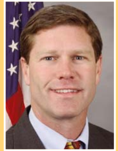
U.S. Rep. Ron Kind