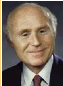
✓ U.S. Sen. Herb Kohl (608) 796-0045

Call Rep. Ron Kind at (608) 782-2558 and Sen. Herb Kohl at (608) 796-0045 and urge them to vote “NO” on the Employee Free Choice Act (EFCA)!