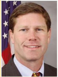
✓ U.S. Rep. Ron Kind (608) 782-2558

Please call U.S. Rep. Ron Kind and U.S. Sen. Herb Kohl and explain how EFCA would impact your business and your ability to create and retain jobs in your community.